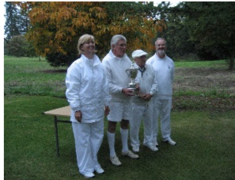
Longman Winning Teams