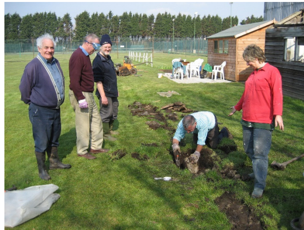
Early work – removing concrete