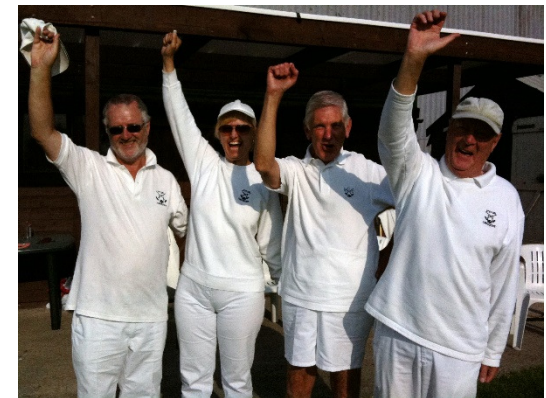
Midweek League Winners