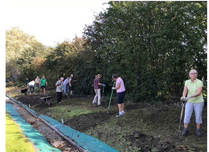
Preparing Martin's Meadow